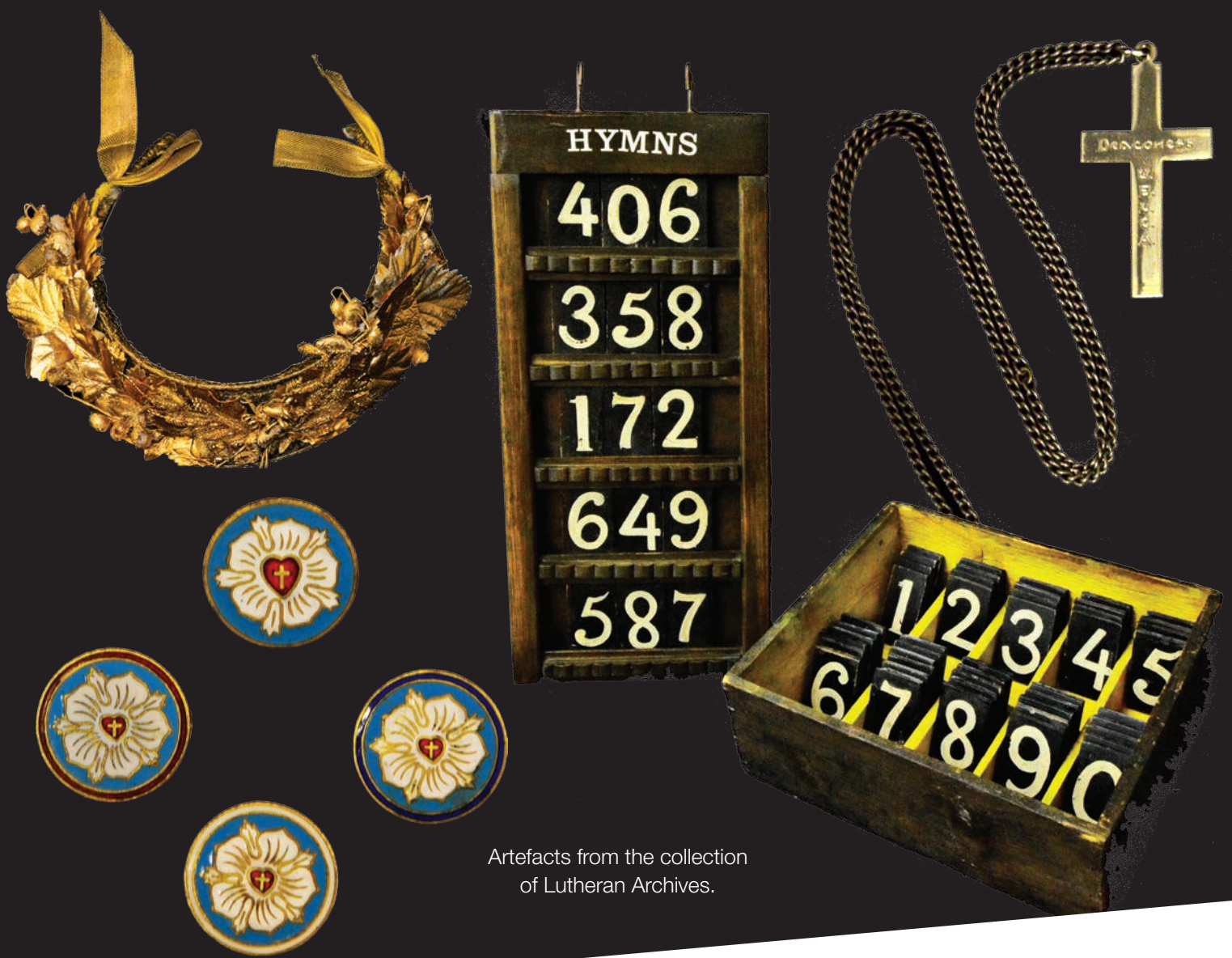
Artefacts from the collection of Lutheran Archives.